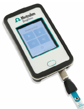
Figure 1. The DROPSTATPLUS instrument and CASTDIR used to connect screen-printed electrodes.

Measurements were performed using DROPSTATPLUS and CASTDIR connectors for screen-printed electrodes (Figure 1).