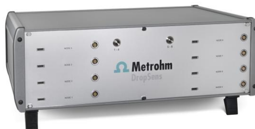
Figure 3. The \mu Stat-i M8One multi-channel potentiostat.

The \mu Stat-i M8One multi-potentiostat (Figure 3) with impedance technology was employed for all measurements. This setup allowed all the EIS experiments to be performed simultaneously for all the mentioned water samples.